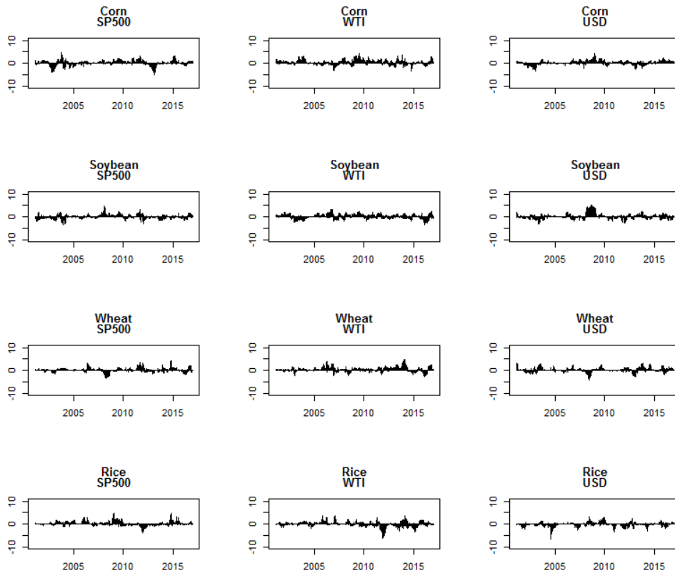
Fig. 1. Net volatility spillovers between the financial market and the food market.

Also the volume of net volatility spillovers is usually low. All this suggests that relations between volatilities in the financial market represented by equity, exchange rate and oil prices and food market are not very strong, thus the results may not be reliable. Our results in this respect are similar to the ones obtained in studies by Diebold and Yilmaz, 2012; Chevallier and Ielpo, 2013; Jebabli et al., 2014; Awartani et al., 2016; Grosche and Heckelei, 2016.